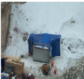
Testing in progress protected from the elements