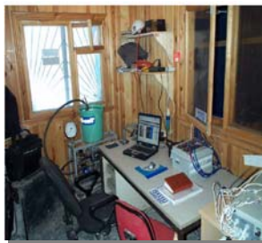
Testing monitored and controlled from inside a heated cabin