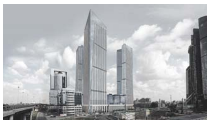
Artists impression of the final construction

Project: Plots 17-18 Location: Moscow Business City, Russian Federation Piling Contractor: KASKTAŞ A.Ş Main Contractor: RENAISSANCE CONSTRUCTION Consultants: NIIOSP Project Description: The Presnensky district of Moscow has been completely rejuvenated with the iconic buildings of the Moscow International Business Center, now known as Moscow-City. Fugro Loadtest were delighted to be invited back for three more tests, located at Plot 17-18, having already successfully tested piles constructed for the foundations of the majority of the other high rise buildings in Moscow-City (Plots 2-3, 4, 9, 10, 11 & 13).