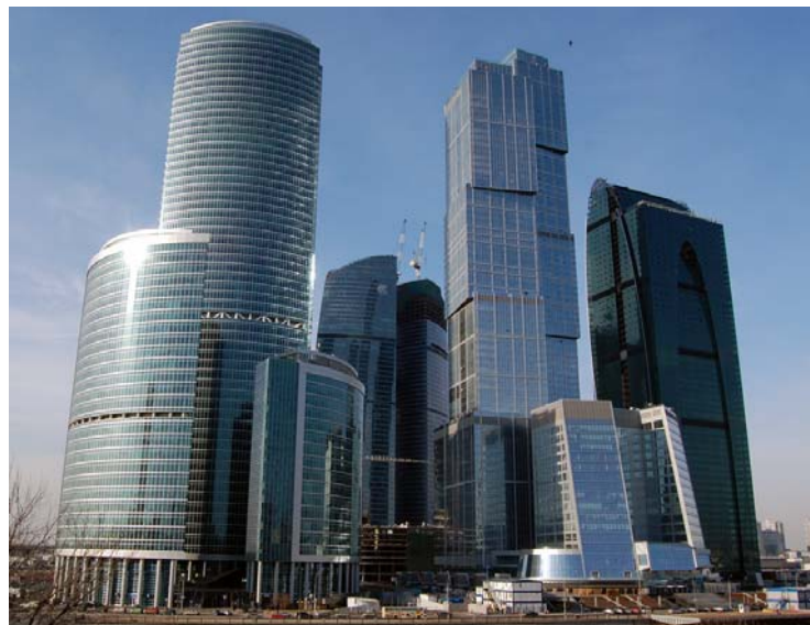
Moscow City Business Centre

The two 1500 mm piles tested at Plots 2-3 were tested to loads exceeding 40 MN. The main concern on this particular site was the settlement expected at the working load. Analysis of the test results enabled the confirmation of acceptable settlements, allowing the construction to proceed with confidence in the foundation design.