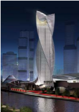
RMJMs Twisting Wedding Palace.