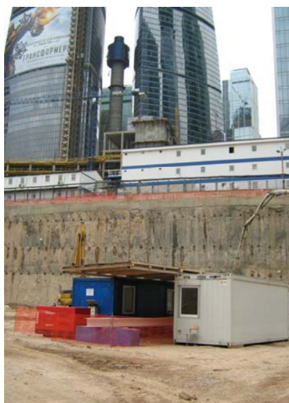
Pile Testing in progress

The, as yet un-named towers on this plot, are expected to be 60 and 65 floors respectively, at a maximum height of 288 metres.