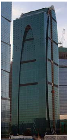
The City of Capitals