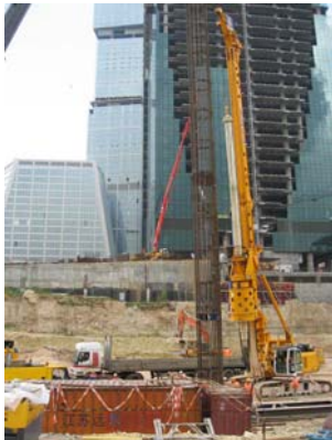
Installation of the reinforcing cage with O-cells