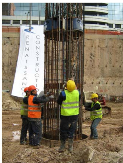
Installation of the O-cell cage