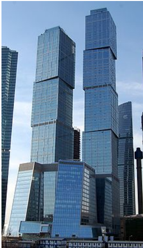
City of Capitals